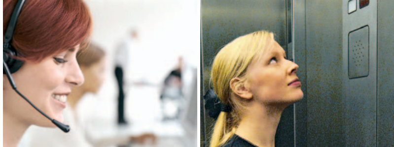
Schindler Servitel Service Center